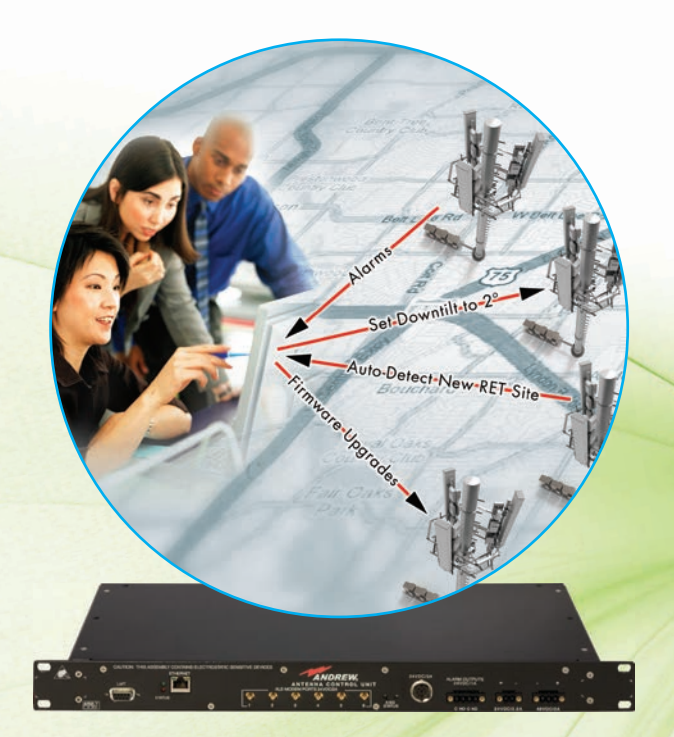
Rack Mount Controller

The rack mount controller allows remote access from a central office and provides alarm monitoring and optional remote firmware update for actuators, AISG TMAs, and controllers.